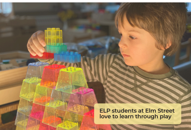
ELP students at Elm Street love to learn through play

To request a link to the virtual meeting email joni.treen@sd76.ab.ca