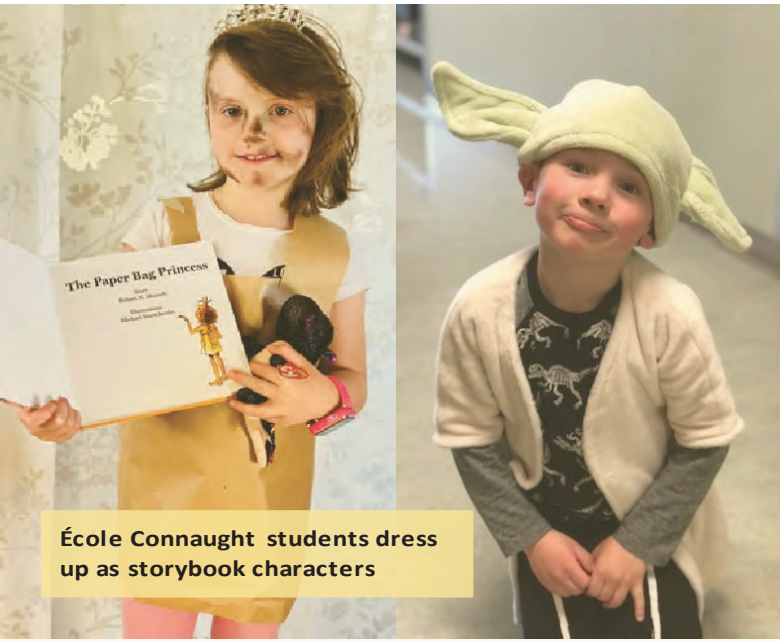
École Connaught students dress up as storybook characters

June 25 - Last day of school for students